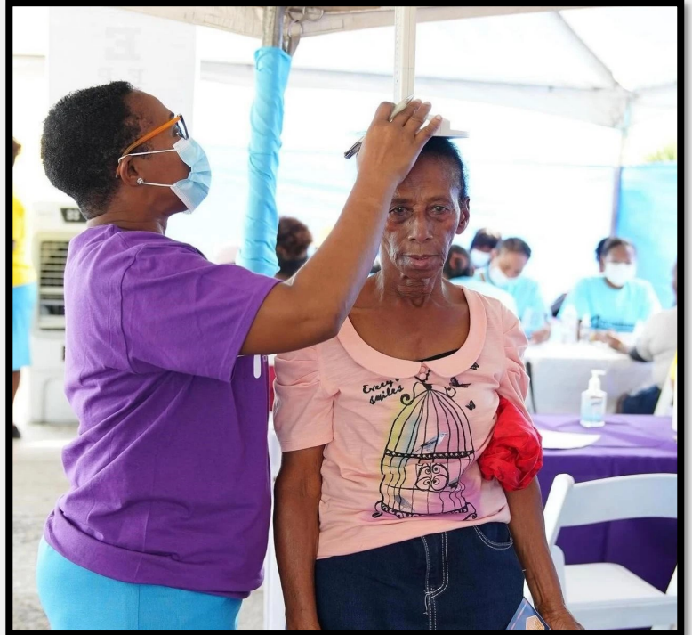
A Community Health Aide checks height of an elderly woman during the #KnowYourNumbers Road Tour at St. William Grant Park on February 1, 2024.

Persons at this event were given an opportunity to know their health status and were given information about the risk factors of non-communicable diseases (NCDs).