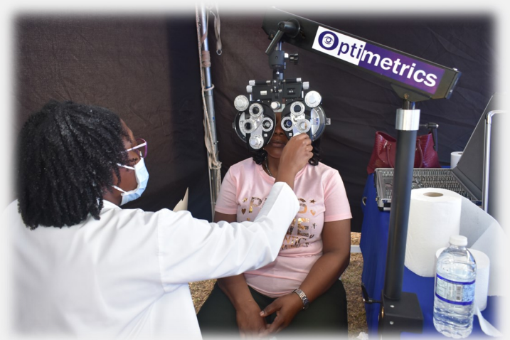
A patient is receiving a free eye care examination from an ophthalmologist at Phoenix Health and Vision during the #KnowYourNumbers Road Tour at the St. William Grant Park.